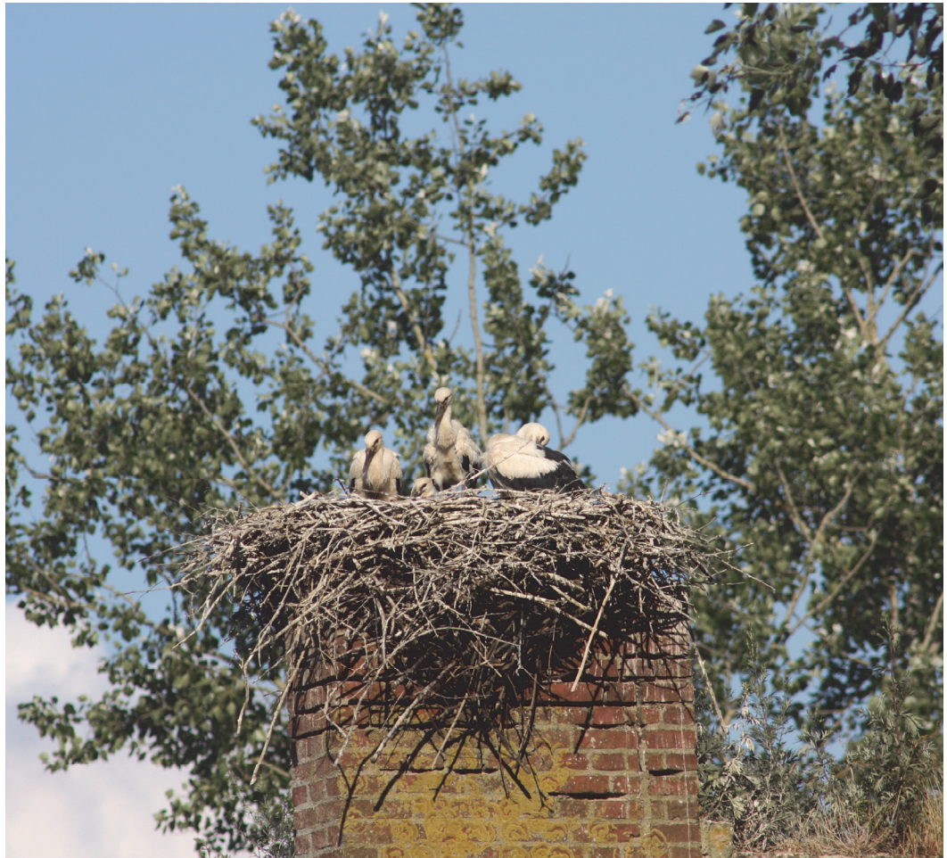
Storks in Danzig.