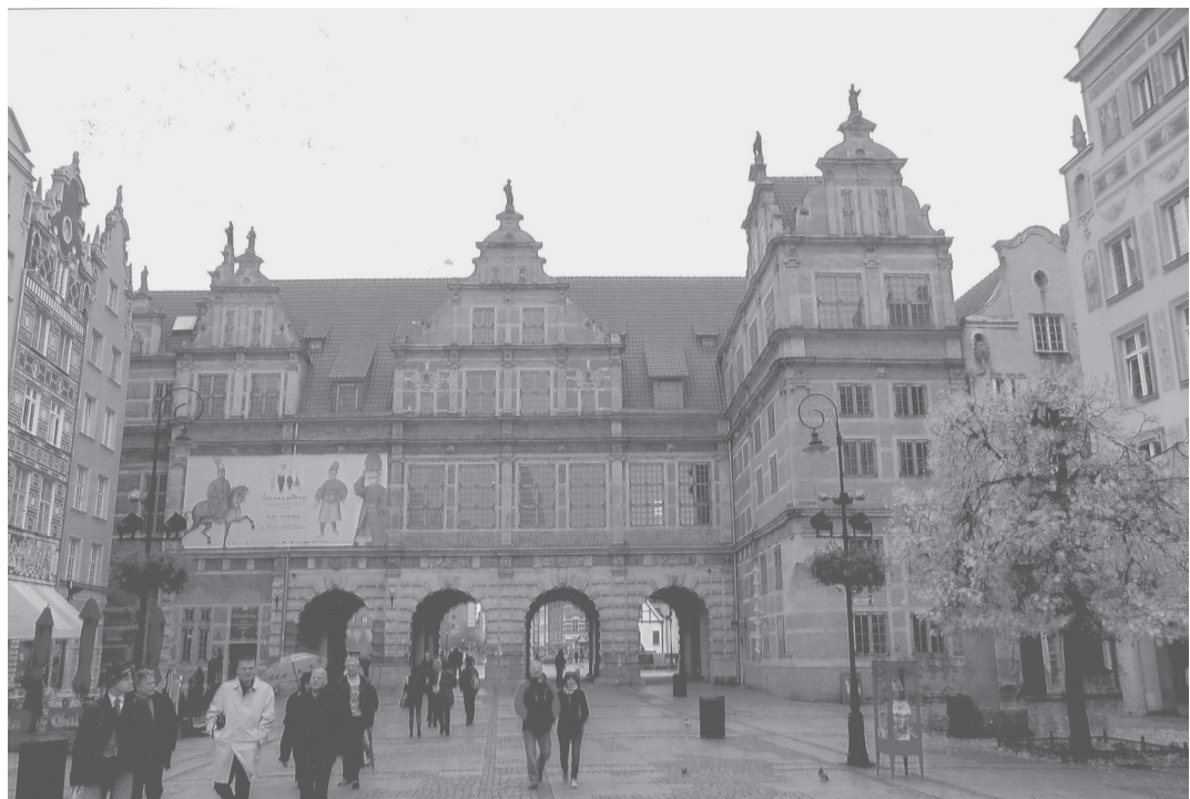
Danzig city gates.

“Vistula delta Mennonites.” n/a. Wikipedia . 2014. www.en.wikipedia.org