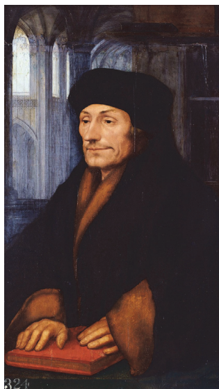
324 Portrait of Erasmus of Rotterdam by Hans II Giovane Holbein

The publication of The Naked Anabaptist by Stuart Murray is both a critique of the way many modern Mennonites have assimilated into the mainstream and a call to return to the foundational peace tradition of the Anabaptists. But the problem with The Naked Anabaptist is this: first generation Ana-