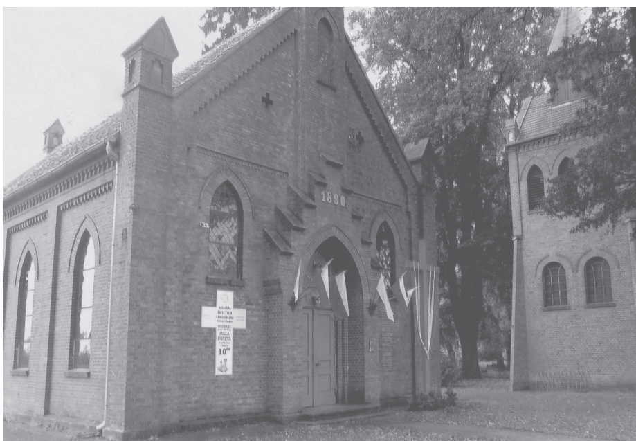
Former Mennonite church (now Catholic) in East Prussia.

Sara Hoeppner's position was more difficult. In addition to a large garden and two cows, she was now in