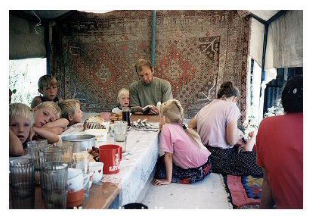
Mennonites in Kyrgystan

The Mennonite story in Kyrgyzstan is not well-known. German-speaking Mennonites and Baptists first arrived there in the late nineteenth century and established several farming villages, including one called Bergtal – a customary Mennonite name. With the establishment of the Soviet state, Bergtal was renamed Rotfront (Red Front) in 1927 and all religious observances were banned by the Communist authorities. Years of discrimination and hardship followed for Mennonites living in the area. More Mennonite settlements appeared in